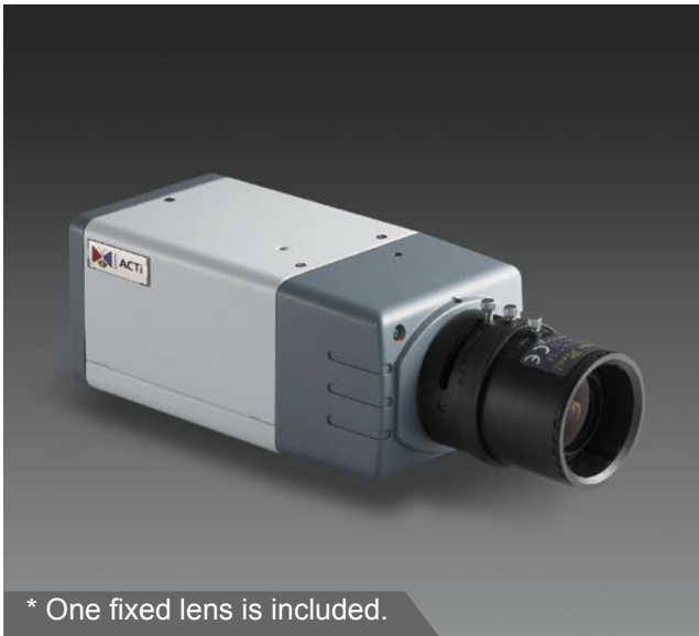
* One fixed lens is included.